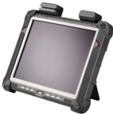
MSR / GPS / Bumper Bar options

The EM-104 stays true to Partner Tech tradition with a host of add on peripherals, including a MSR reader, fingerprint reader, GPS module, VESA mounts, a table top stand, and much more. Partner Tech is proud to present the new EM-104 for 2011, the ultimate Mobile Performance Tablet.